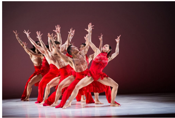
Ballet Hispánico.

of this award include Carlos Santana, General Colin Powell, Sonia Nazario, Edwidge Danticat, Gerda Weissmann Klein, and others.