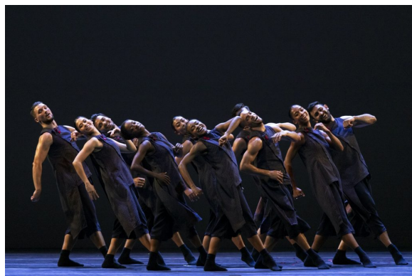
Ballet Hispánico performs “18+1”