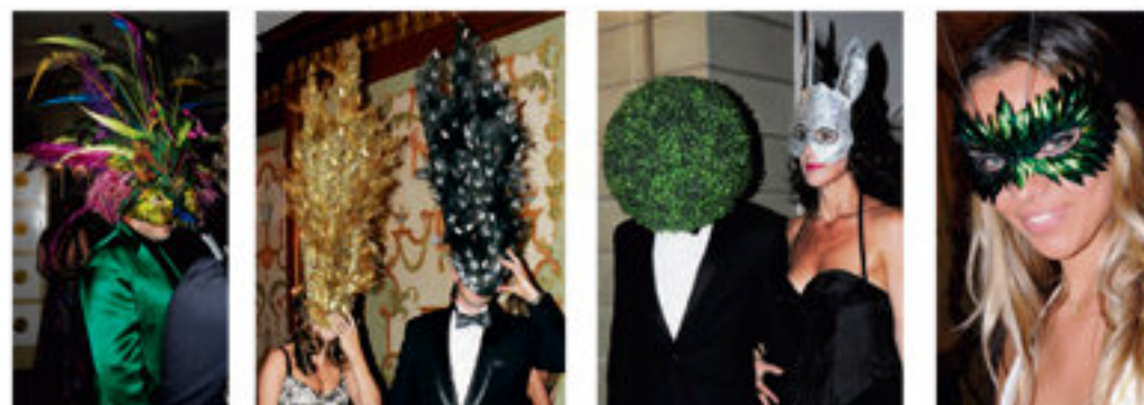
April 4: Save Venice Inc., which raises money to preserve the art and architecture of Venice, held its Enchanted Garden Ball at the Pierre. Among the projects benefiting from the event are the restoration of the Church of San Sebastiano and Vittore Carpaccio's St. Ursula cycle at Gallerie dell'Accademia. Guests wore either masks or headdresses, reminiscent of the masked charity balls held in New York after World War II.