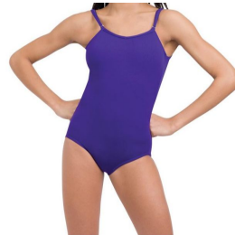
Levels 4A & 4B Purple