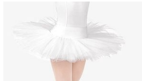
Required for Students in Classical Variations Any brand, white, practice pancake tutu Teacher will advise when to wear