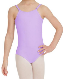
Levels 2A & 2B Vibrant Violet