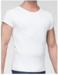
Any brand white fitted dance t-shirt (recommended Body Wrappers B190 , B400 WHT)