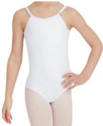
Levels 1A & 1B White