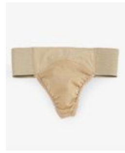
Any brand nude dance belt (quilted style recommended)