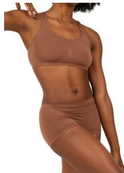
Capezio style ID # 3760W