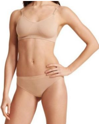
Capezio style ID # 3564/3678

Any undergarments are required to be flesh tone. Examples below: