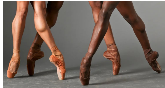
Level 3A-5: Any brand preferred choice of pointe shoes. *Level 3A students will be introduced to pointe work gradually throughout the year and should wait for teacher to advise when to purchase shoes so that student does not outgrow shoe prior to pointe work introduction. 3A students should purchase pointe shoe ribbons at the start of the year. Your teacher will guide you on how to sew them onto your ballet shoes.