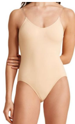
Capezio style ID # 3532