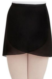
Level 5 Required for performance, optional for class 3A-4B Optional for class at the teacher's discretion Capezio black wrap skirt style # N272