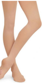
All Levels: Any brand flesh toned transition tights (recommended Capezio style # 1915 )