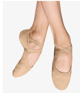
All Levels: Any brand flesh toned ballet slippers (recommended styles Bloch # S0284G , SoDanca # Bliss SD16 ), Capezio # 2307W